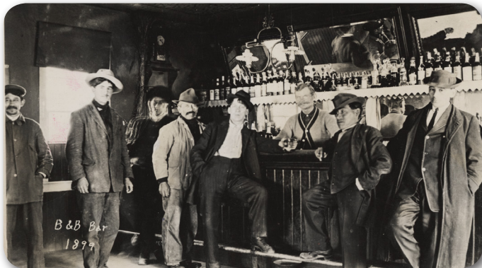
B&B Bar in 1899. The B&B is still in the original building, though the location has changed.