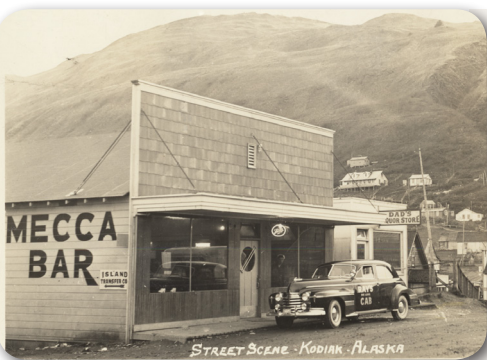
Mecca Bar in downtown Kodiak, 1950s.