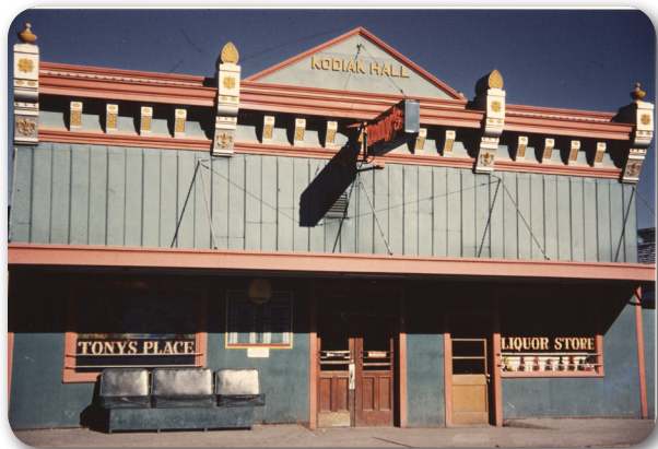
Tony's before the 1964 earthquake