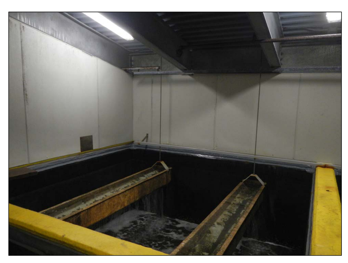
Sprinkler Pipe Over Seawater Filter Tank