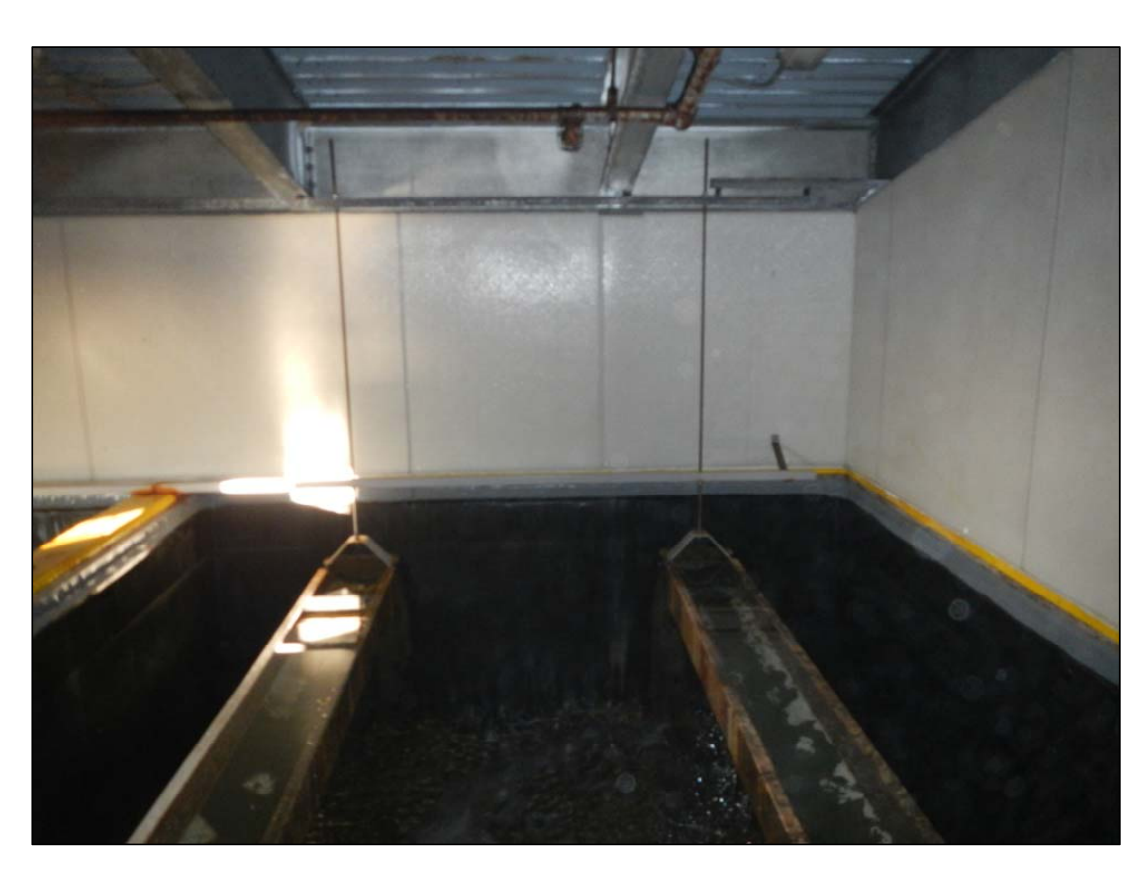
Sprinkler Pipe Over Seawater Filter Tank