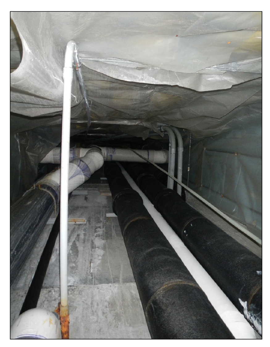
Interior of Pipe Chase