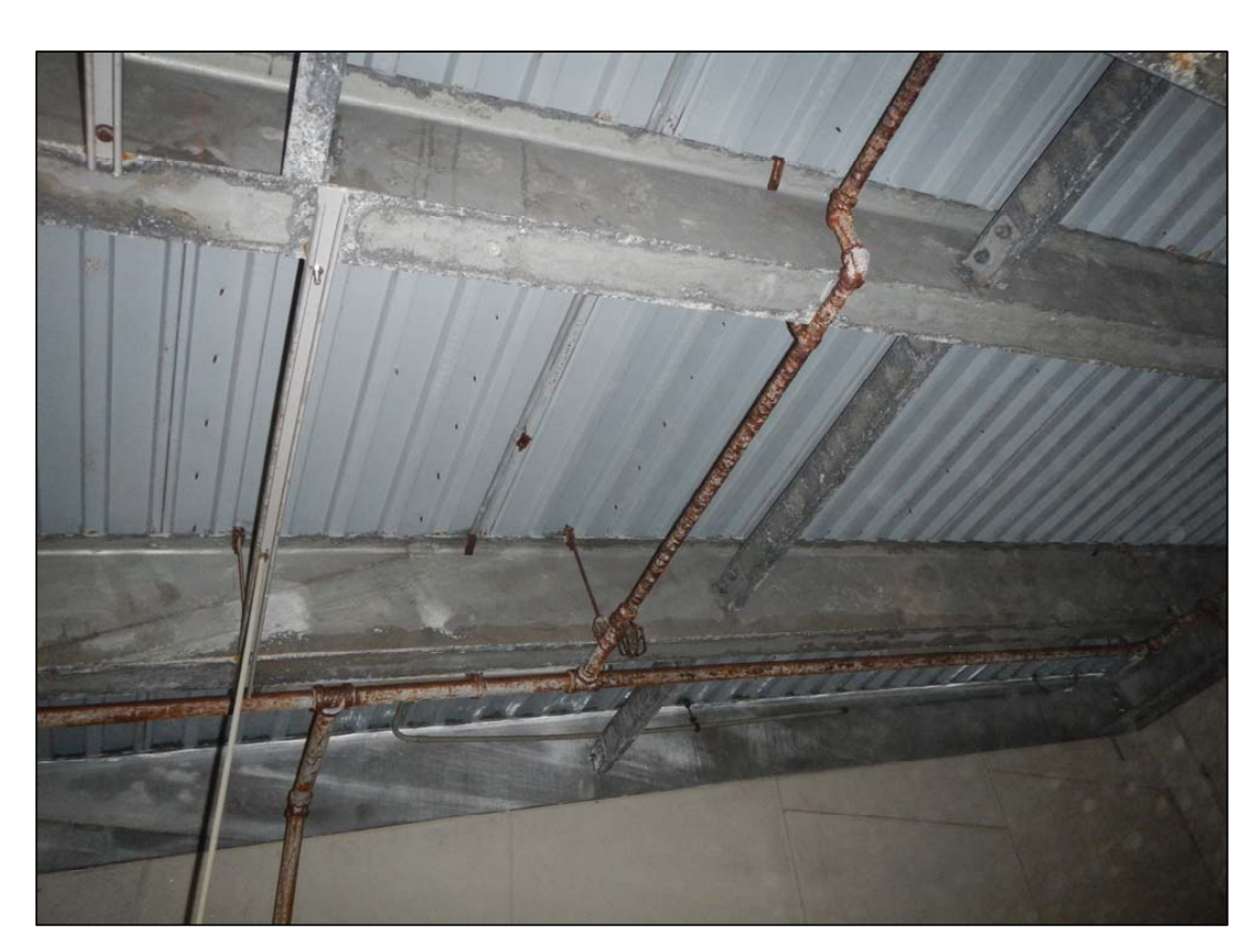
Corroded Sprinkler Pip